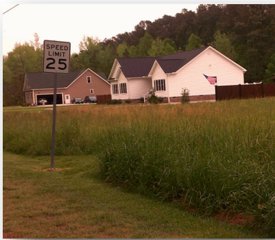
Tall grass reported on Moreell Avenue with a Violation Notice Sent to the property owner

As of April 30th, there were 20 active Code Enforcement Cases under review.