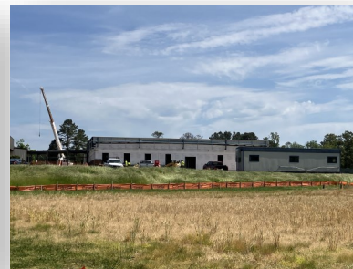
Crater Criminal Justice addition under construction on County Drive

“A welcoming community · Embracing its rural character · Focusing on its prosperous future”