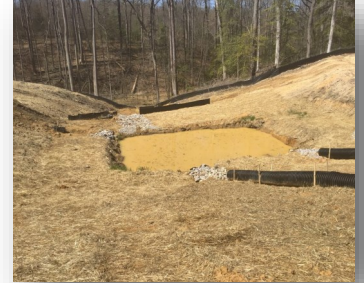
Lakewood Townhomes on Prince George Drive Bio Retention Pond under construction